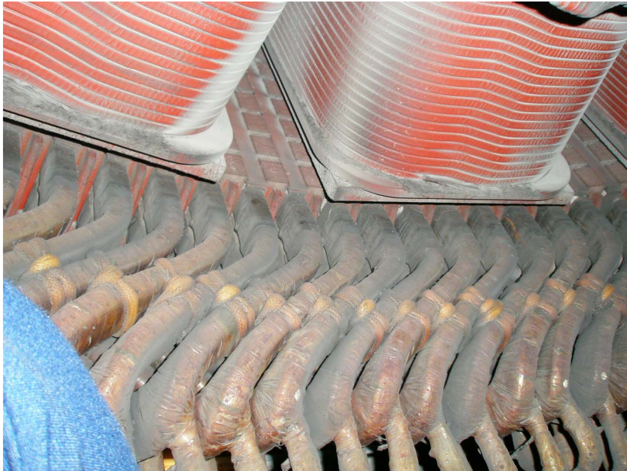
Glass tapes were found exposed on a few locations just outside the slot area due to peeling of corona tape.